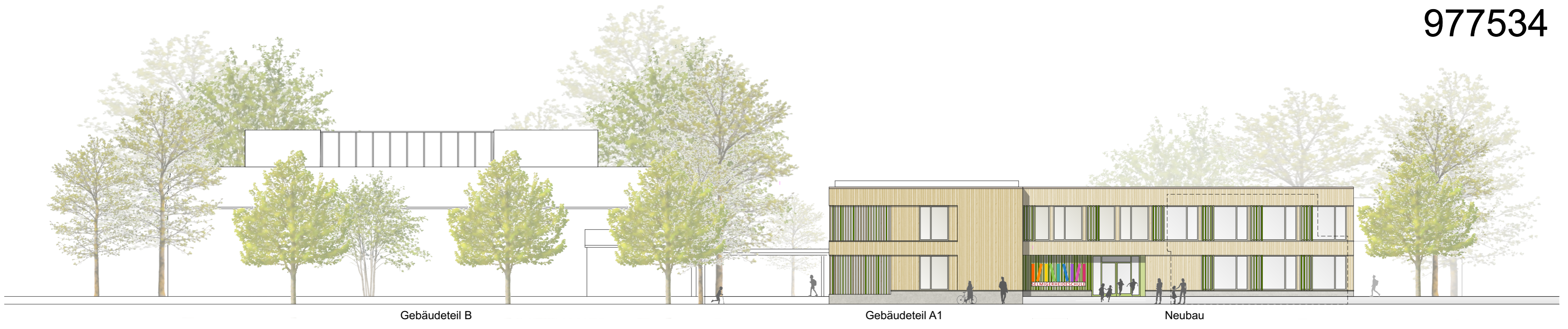
Ansicht Ost Haupteingang 1:200