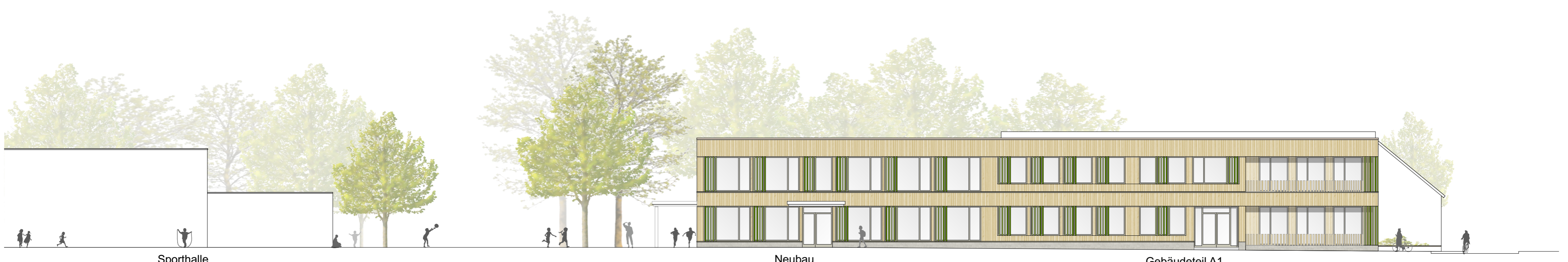
Ansicht Süd 1:200